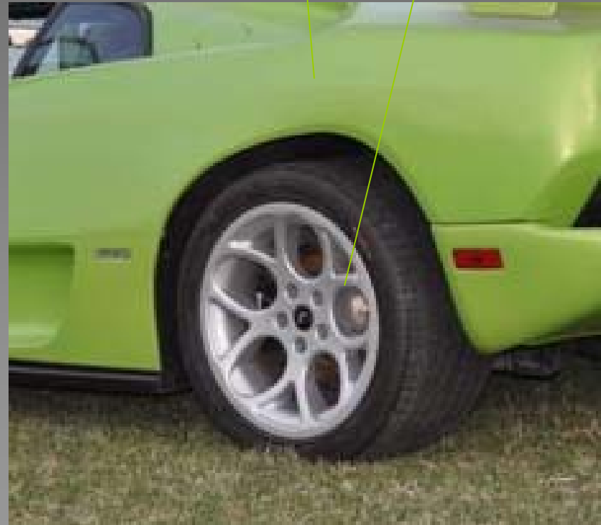
Rear Michelin 335 x 30 x 18 ZR