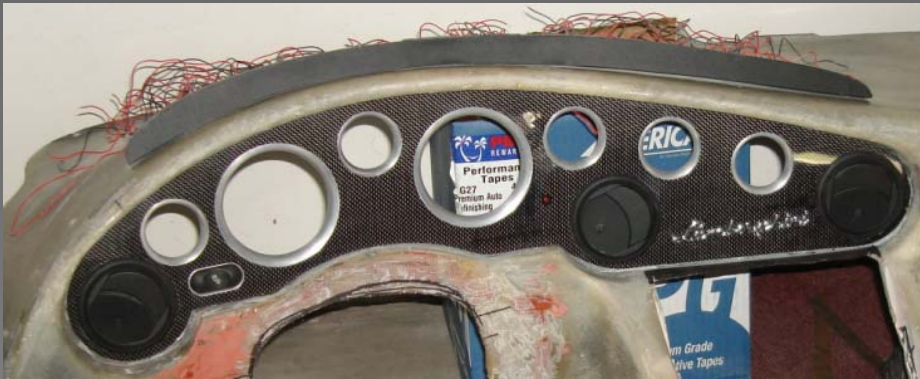
Light bar with lights