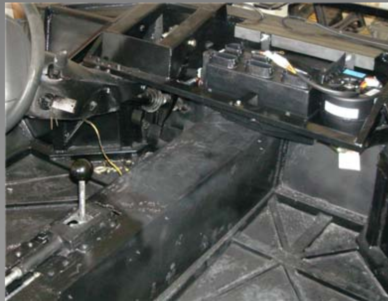
Functional OEM heater controls that operate new Vintage A/C unit