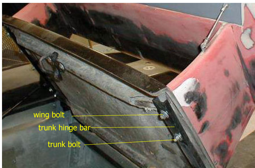
FIGURE 135. Wing bolt connections to trunk