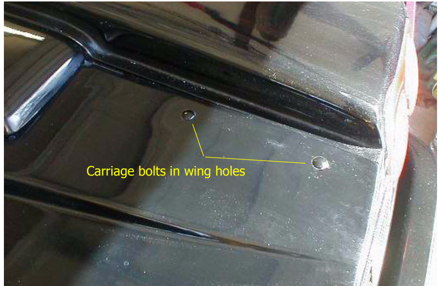
FIGURE 136. Trunk lid without wing